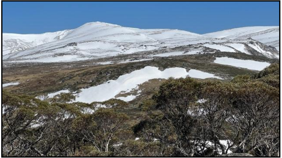
The high peaks were again clothed in bridal white - Carruthers - Wed 18 October