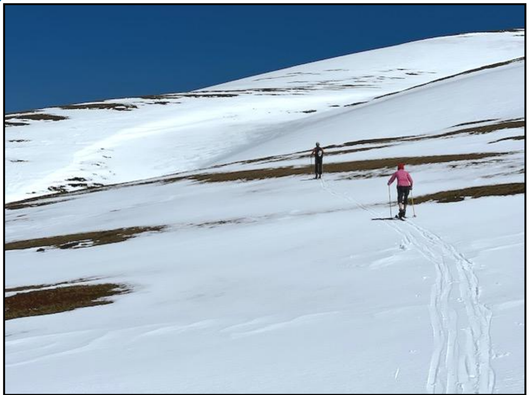
The upper snowfield on Carruthers Peak approaching the false summit - Wednesday 18 October.