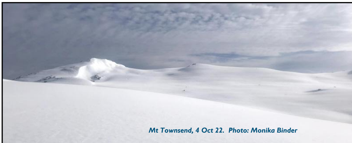
Mt Townsend, 4 Oct 22.

Ian Turland (Past) CCCSC President 28 September 2022