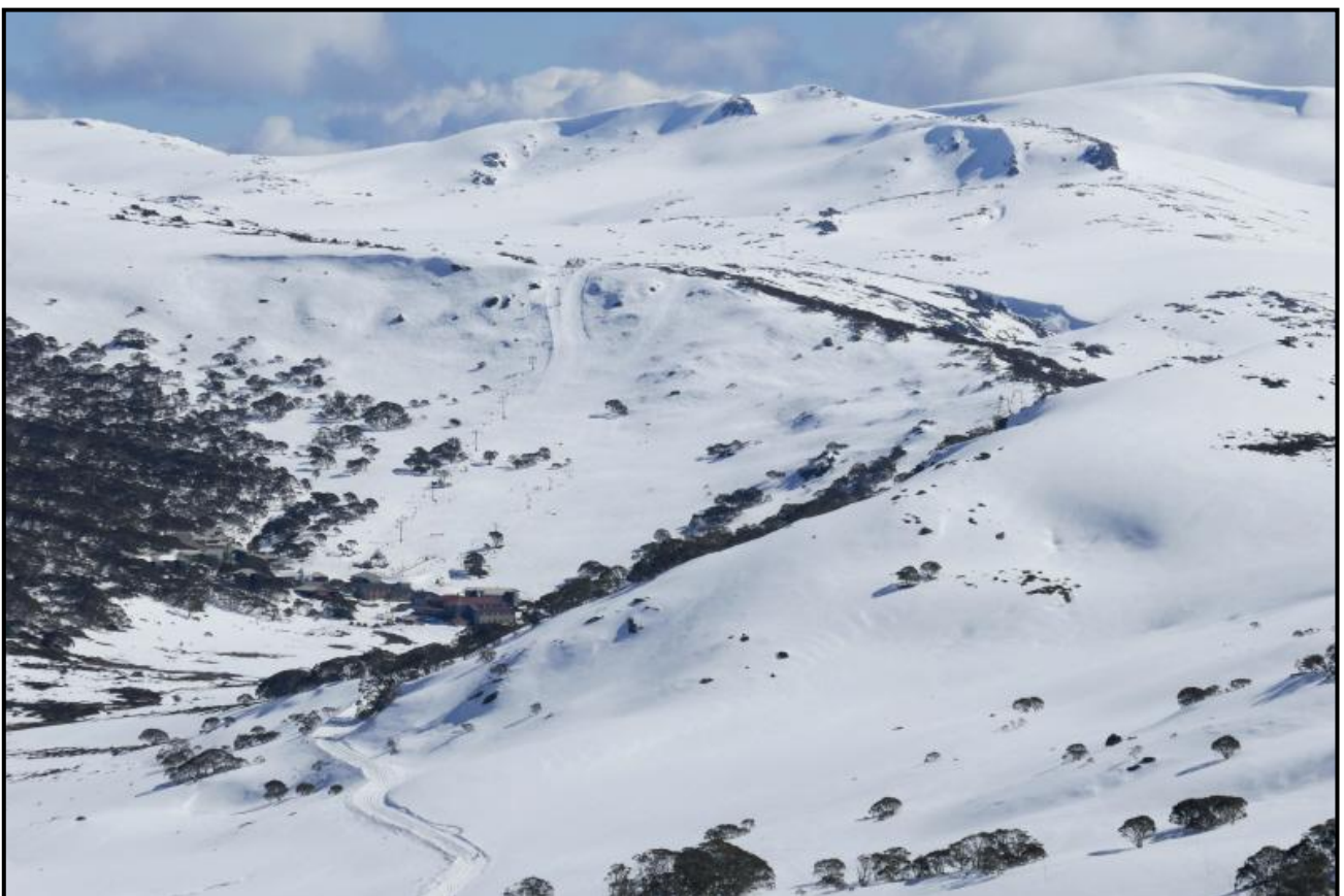
View of Charlotte Pass Village nestled in its bowl. Also visible is the road to the pass and Etheridge Ridge and Mt Kosciuszko in the background. From the Southern trig point on The Paralyser. During one of David Russell's tours during his Guthega lodge fortnight. Tuesday, 13 September 2022.