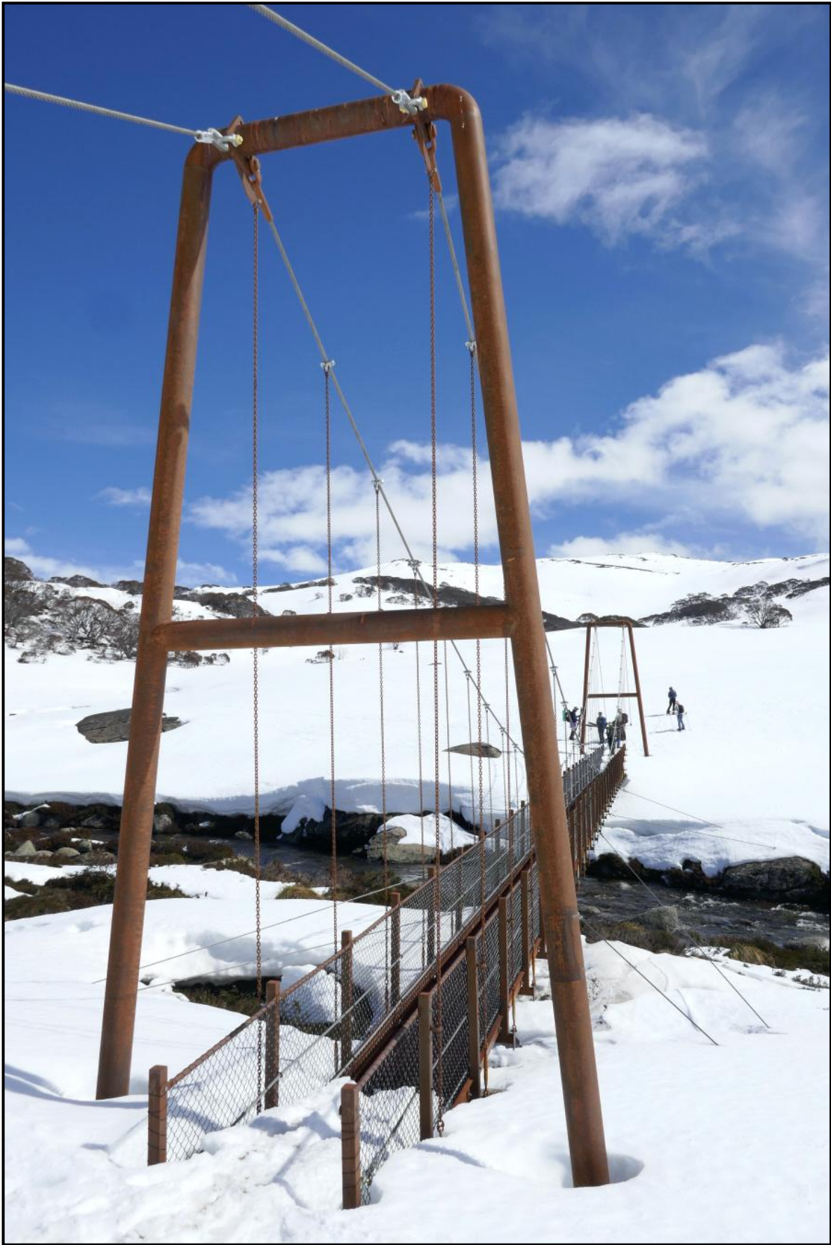
The Spencer's Creek suspension bridge. On one of David Russell's tours during his Guthega lodge fortnight. Tuesday, 6 September 2022.