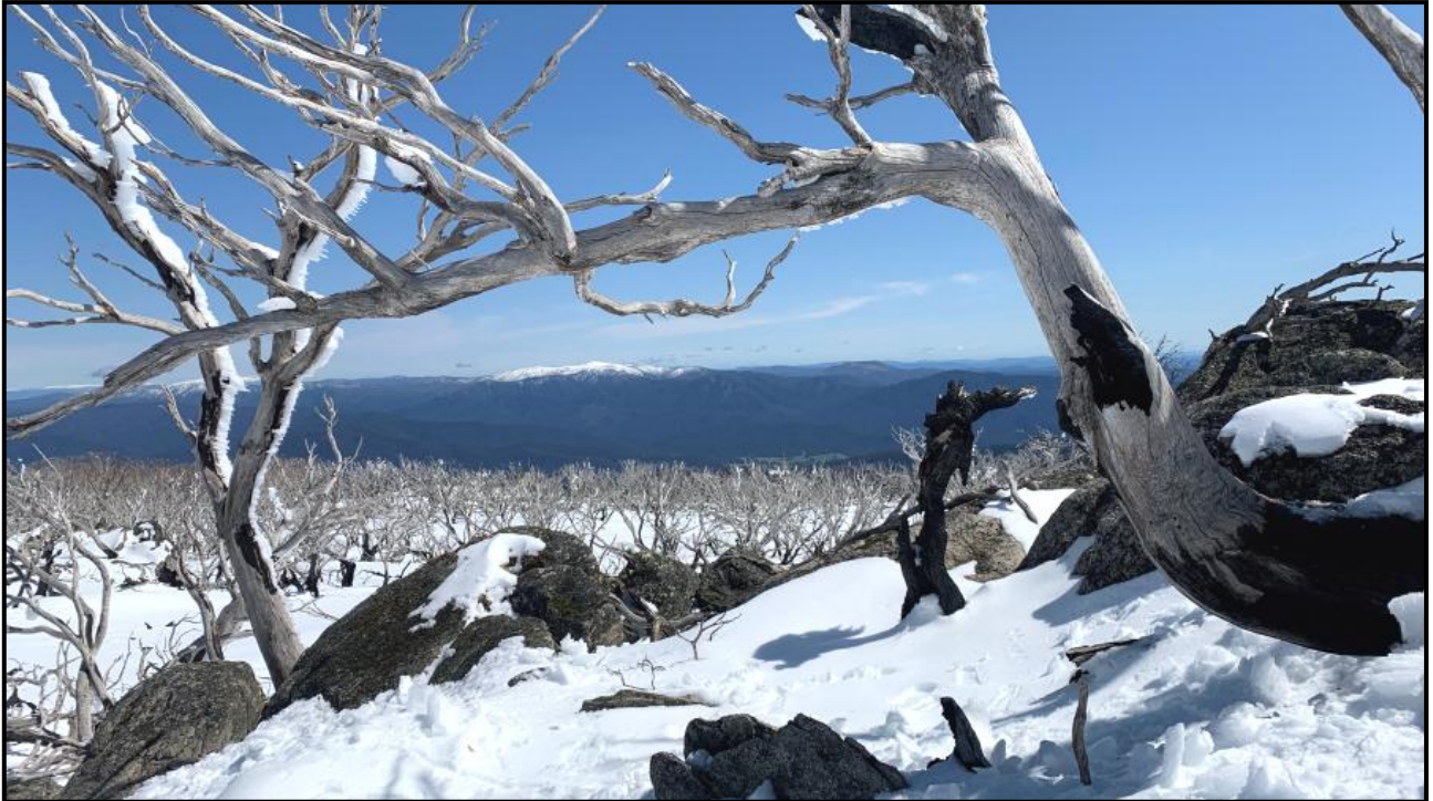
Victorian snow fields, from near Horse Flat. On a Club tour from Dead Horse Gap to Horse Flat and Cascades Fire Trail. Tuesday, 20 September 2022.