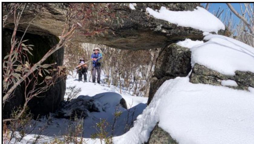
At the Devil's Dolmen on Bob's Ridge.

Rime covered tree at Horse Flat.