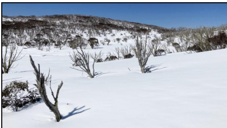
Horse Flat.