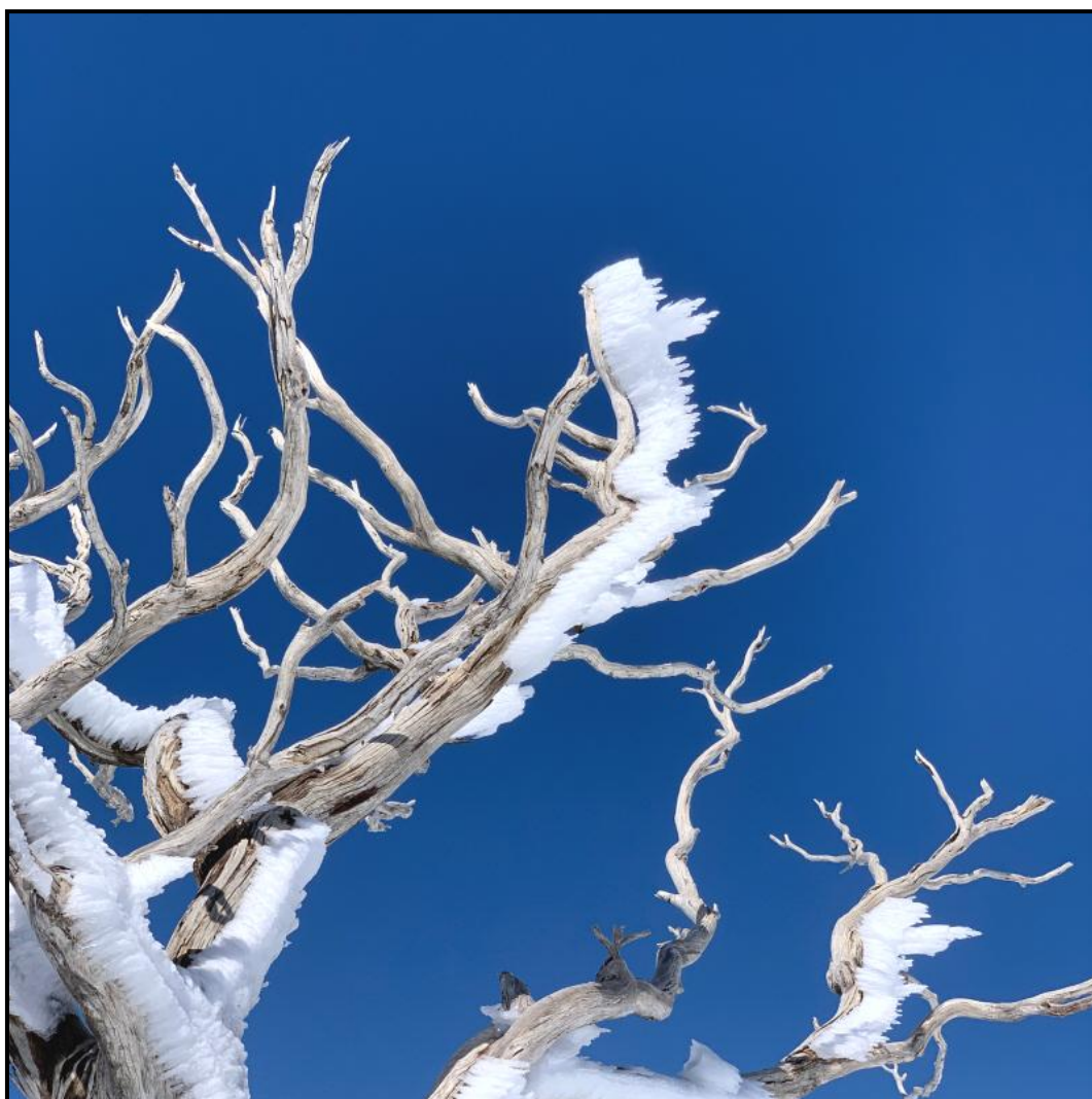
Rime ice on a dead snowgum tree. On a Club tour from Dead Horse Gap to Horse Flat and Cascades Fire Trail. Tuesday, 20 September 2022.