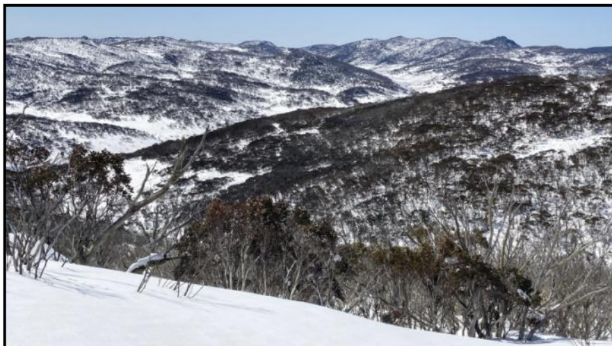
View towards the Thredbo River valley and The Chimneys.