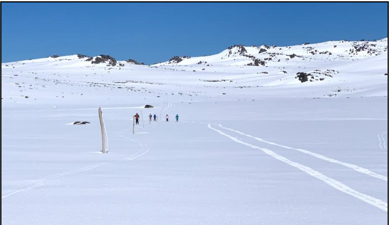
Perfect snow under a perfect sky. Following the pole line from Thredbo to the Summit Road, on a Thredbo to Perisher ski tour. During one of David Russell's tours during his Guthega lodge fortnight. Wednesday, 14 September 2022.