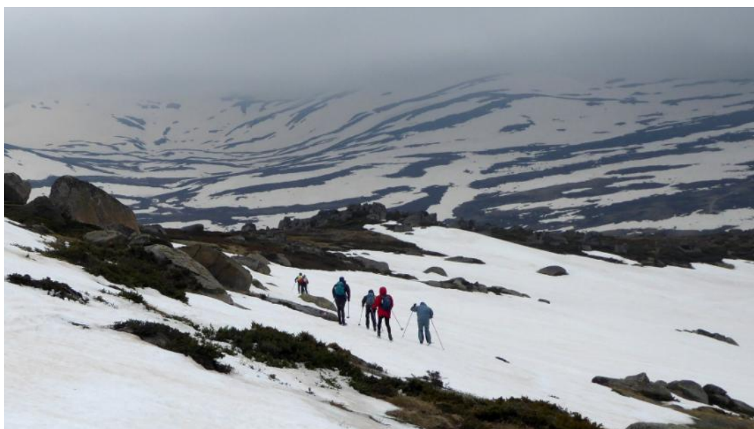
Group descending Mt Stilwell ahead of an approaching storm. 20 October 2018.