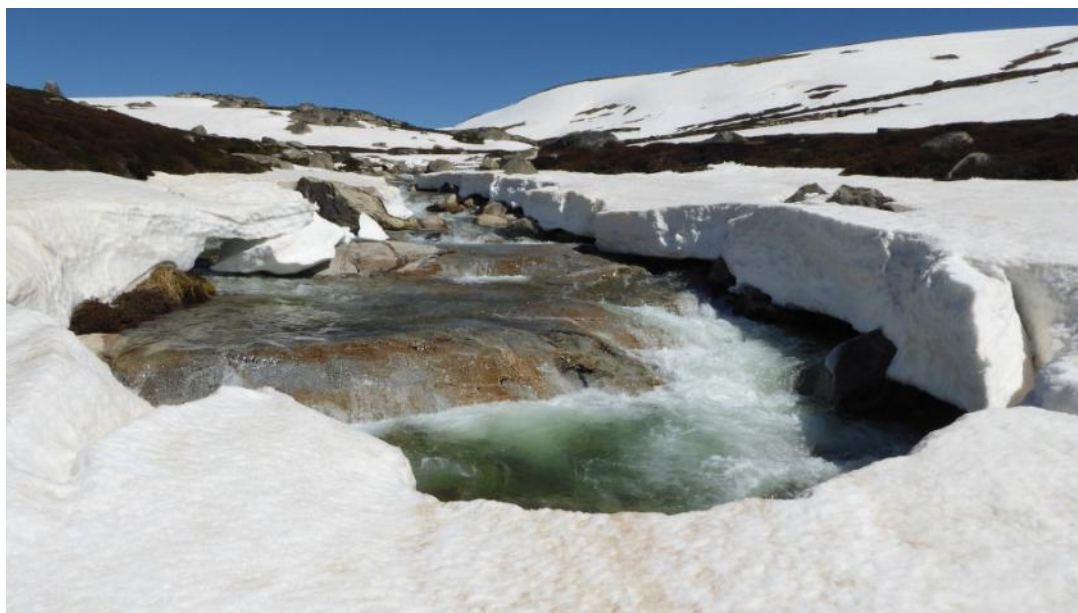
The upper Snowy River. 21 Oct 2018.