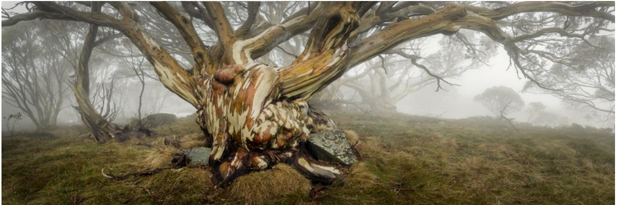
Old snow gum taken up behind Charlotte Pass during a storm, on the Lodge weekend. They always look their best in the wet. 20 October 2018.