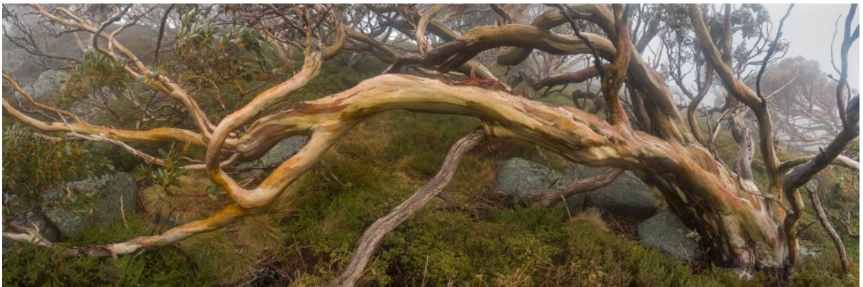
Twisted snow gum near Charlotte Pass in the rain. 20 October 2018.