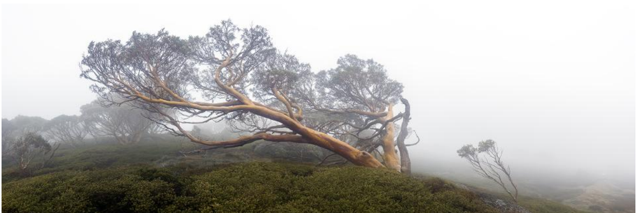
This snow gum really stood out across the mountain with its yellow trunk. 20 October 2018.