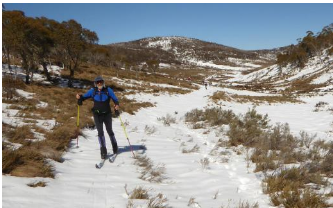
Bruce Porter skiing below Tantangara Mountain near Kiandra, 10 Sept 17