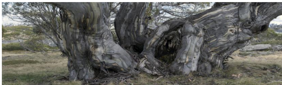
Magnificent Jagungal Snow Gum on Tarn Bluff, above Bluff Tarn. There was plenty of snow around Bluff Tarn but had melted on the bluff. The following night, and morning, we had another couple of cms of snow. 5 Nov 2017