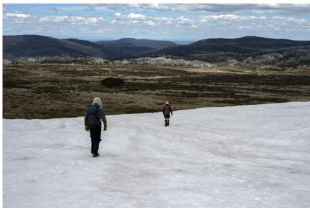
Returning to campsite, below Burrungubugge Gorge, from Bluff Tarn, 5 Nov 2017