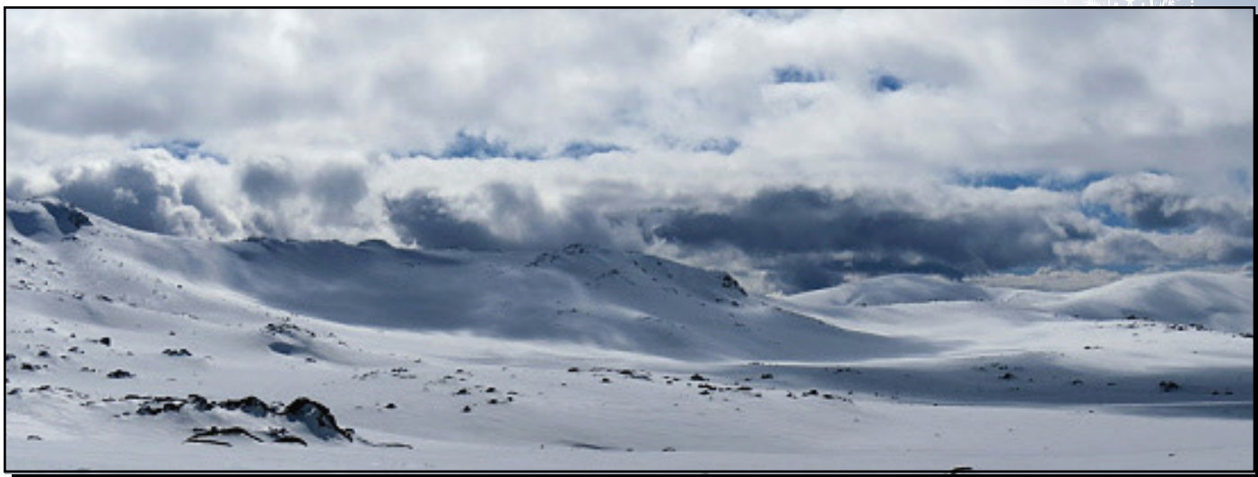
Etheridge Ridge and the Main Range.