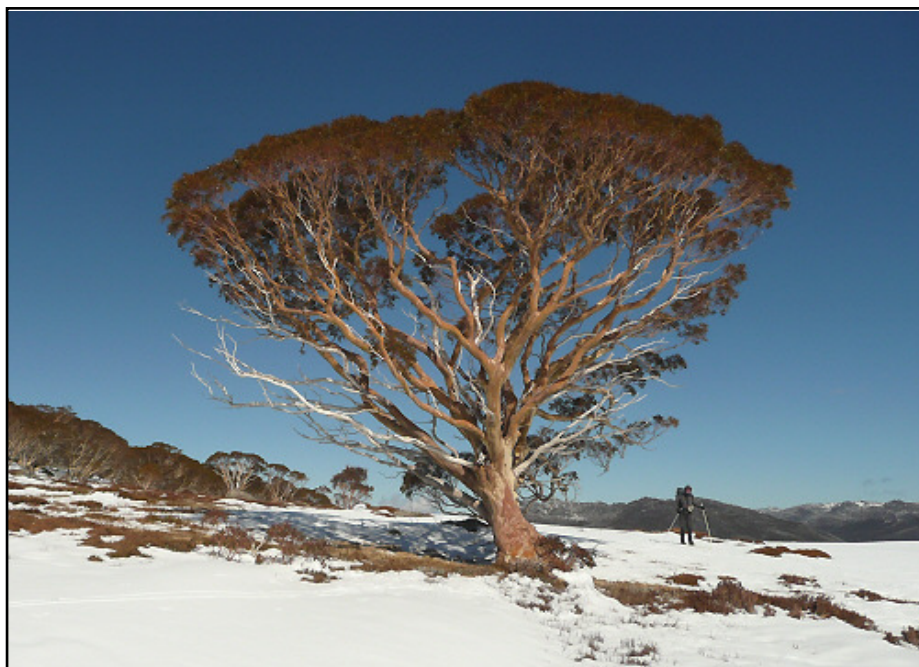
Tim Wright skiing near Trapyard Creek — 6 Sept 14.

The cost per person for accommodation is $40 per night. Once confirmed, payment will need to be paid prior to the weekend, either by sending a cheque to the Club (payable to "Canberra Cross Country Ski Club") or via the Register Now site: