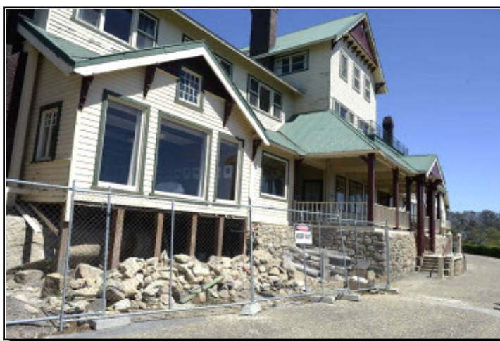
Work has already commenced on redeveloping Mt Buffalo Chalet.