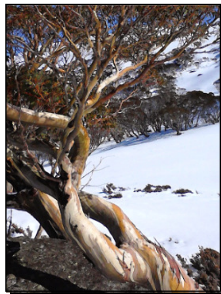
Group skiing near Spencers Creek, and snowgum (above).