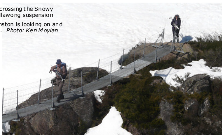
Greg Lawrence crossing the Snowy River over the Illawong suspension bridge. Gale Funston is looking on and waiting her turn.