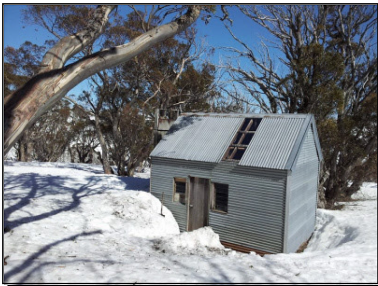
Edmondsons Hut near Falls Creek — 22 Aug 14.