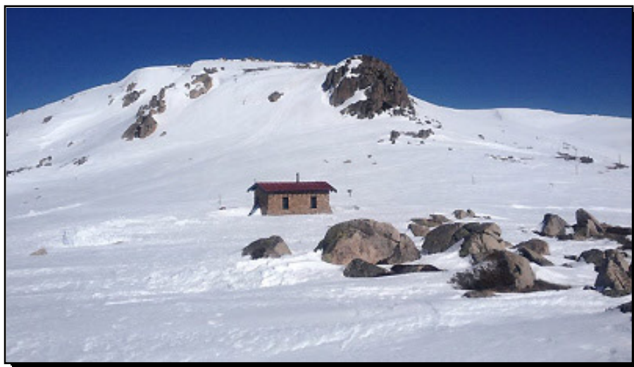
Seamans Hut and Etheridge Ridge — 31 Aug 14.