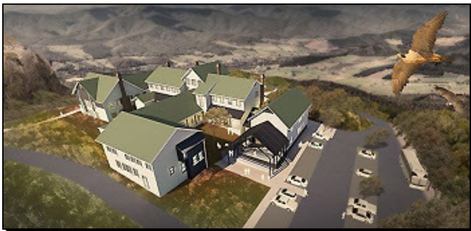
How the Chalet will look following redevelopment.

In the future, visitors to the Chalet will be able to enjoy a new terraced café and tourist information area. The café will open up new viewing areas with a decked terrace on the south side of the building offering panoramic views out across the Gorge.