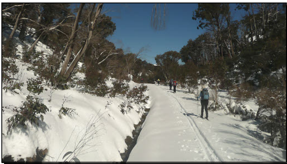
Skiing along the Reservoir Road trail.