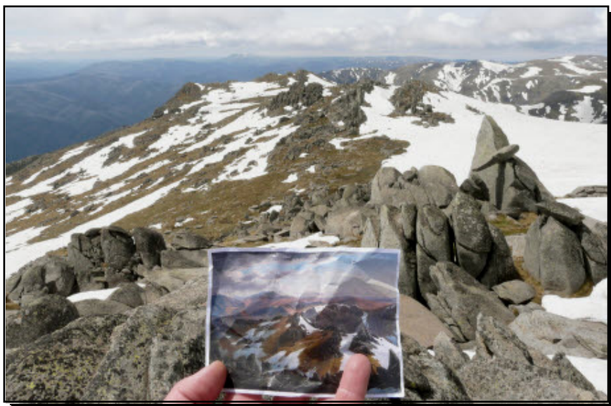
North-east view from the northern top of Mount Kosciuszko. Including a reproduction of Eugene von Guérard's famous painting — 3 Nov 12.