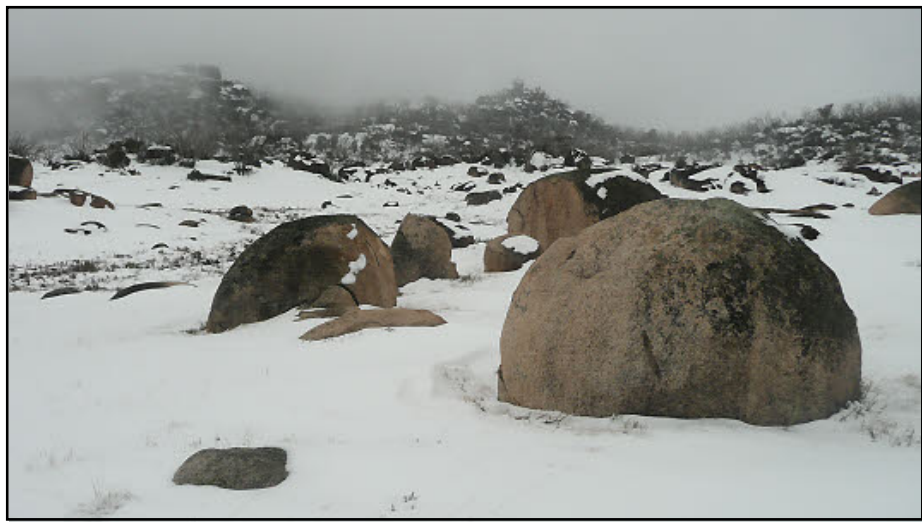
Rocks and giant boulders are a feature of the terrain at Mt Buffalo.

A detour can be made off-track to reach Dickson Falls on the edge of the plateau, which has views east towards Bright and the Victorian Alps.