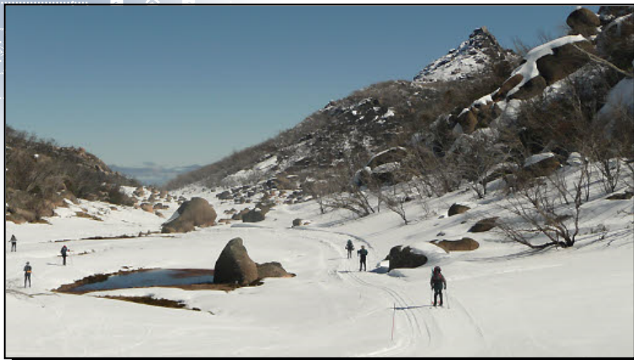
Skiing on the groomed trails below The Horn.