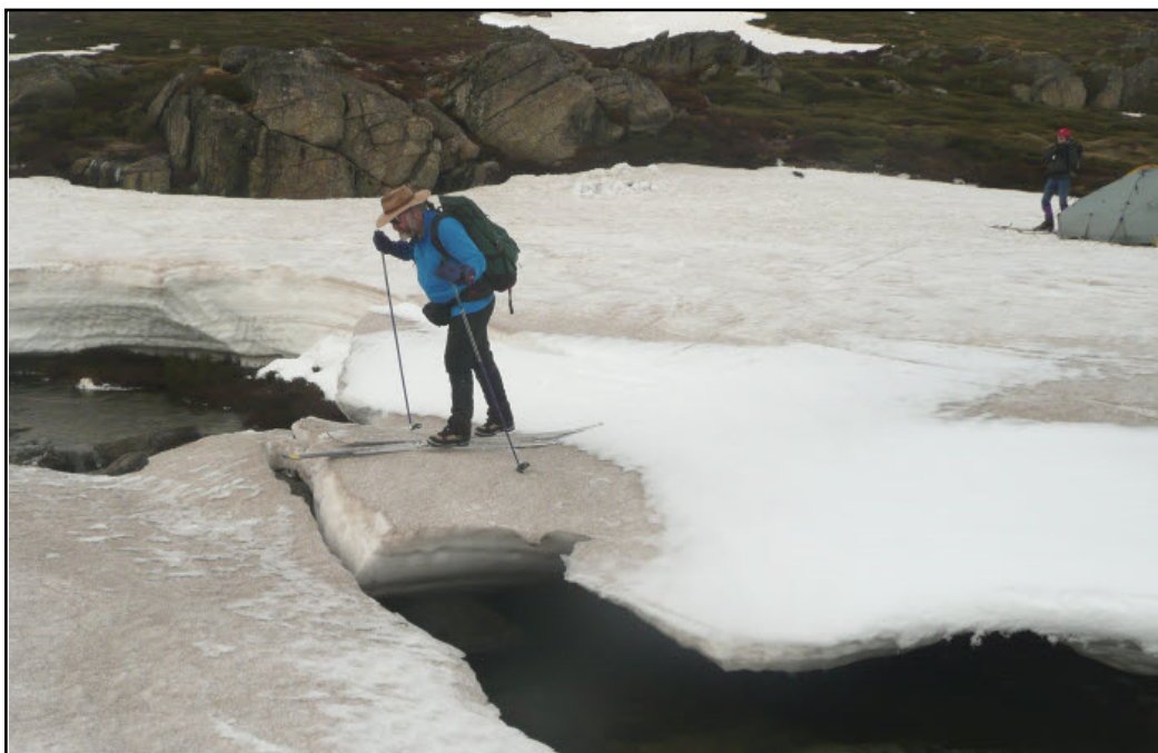
Skiing on thin ice! Ken Moylan testing a snowbridge on a late season snowcamp — 8 Oct 12.

Membership Subscriptions for the 2013 season are now due