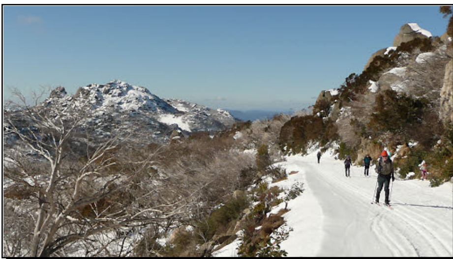
Skiing up The Horn Road, with The Hump and Cathedral behind.

This article describes some ski tours that can be done at Mt Buffalo.