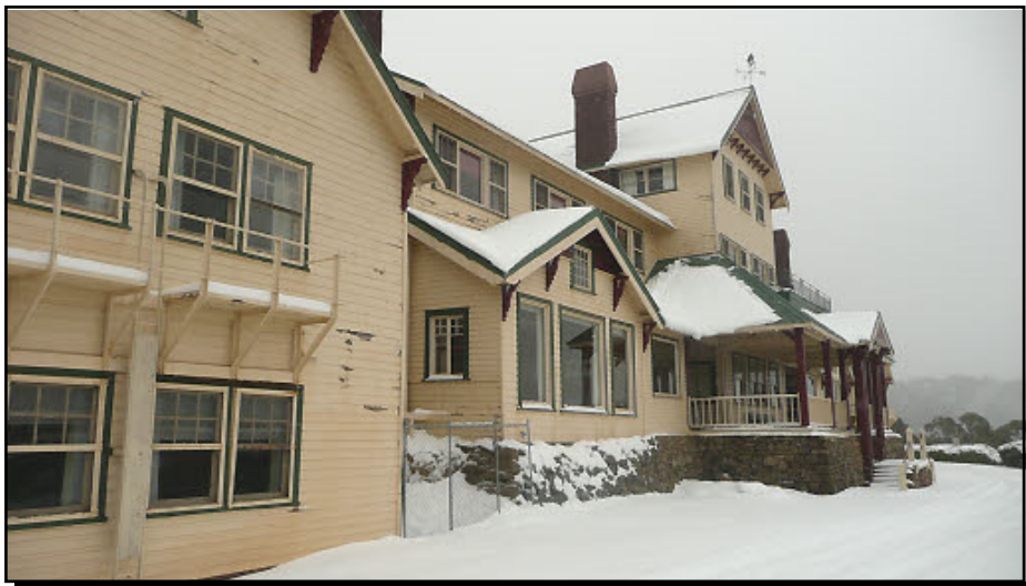
Mt Buffalo Chalet, built in 1910, after a snowfall.