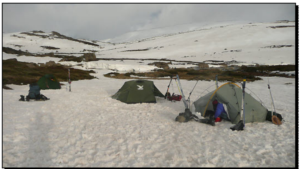
Campsite near the Snowy River.