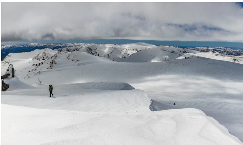
View north from Mount Townsend.