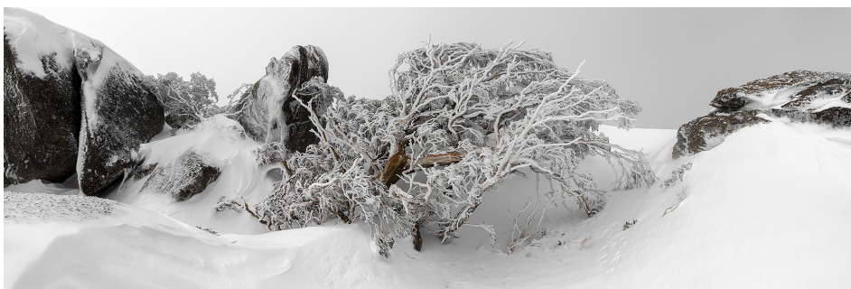
Hard life for a snow gum, covered in ice and snow on a ridge between South Ramshead and Bogong Creek. 12 August 2018.