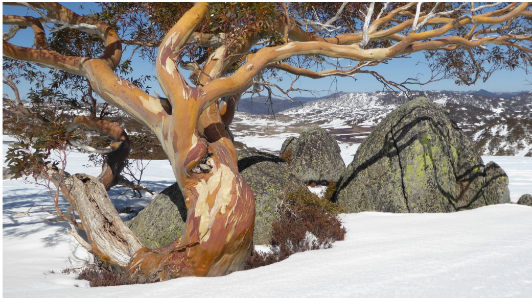
Snowgum near the Paralyser Gap, with Betts Creek valley in the distance. 21 Sept 2018.