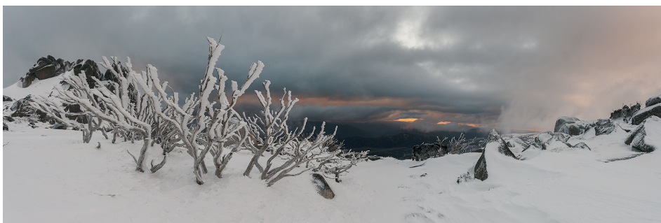
Sunset at South Ramshead on 17 August 2018.