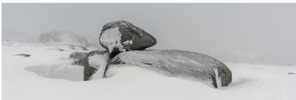
Just some rocks between South Ramshead and Bogong Creek. 12 August 2018.