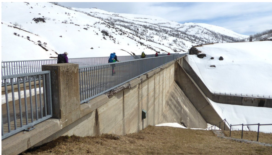
Crossing the dam wall at Guthega before the climb up to Guthega Trig.